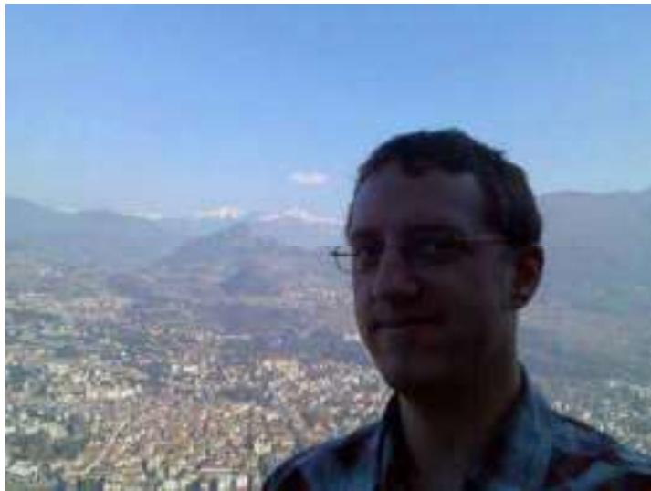
Figure 1 Not such a bad view from the balcony of my room ....

The school was held in the very nice city of Trento is located in the northern mountain areas of Italy. The accommodation was excellent, based on the same place as the lectures high up on the mountain side with an enormous view of the valley. We made a joint trip to a local winery where we learned the basics about wine making and we also had a delicious dinner where we tasted different types of wine. To travel in Italy was no problem if you are not afraid of high taxi speeds.