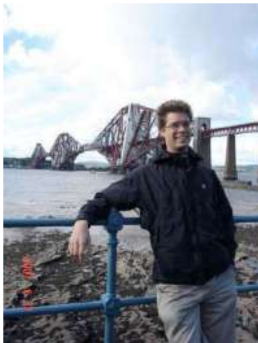
Myself at the Forth bridge

Together, the above reasons made the visit to DSN successful, even though I did not present a paper myself. Many thanks to ARTES for giving the grant for the trip!