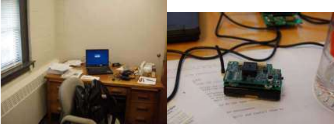
My office at University of Virginia & a MICAz mote.

To evaluate our design we have implemented part of it as a proof of concept. The key features of our design is present in this implementation, i.e., we show the ability to sense the environment and to react based on the sensed data and simulated results based on the sensors. First we have collected vital signs (heart rate and blood oxygen level) data from volunteer persons. We then use this data in a replay fashion to achieve a scenario where the data represents a patient under examination without any risk to any real patients and with the ability to reproduce the scenario any number of times. Under normal operation the simulation application reads the sensor values that reside in the database every 10 seconds. Should something out of the ordinary occur, for example a spike in the heart rate or if the blood oxygen level suddenly begins to drop, the frequency of read readings will double to allow for a more fine grained data collection that the simulation application then uses as input. Should the patient's condition continue to decline the read frequency will increase until the maximum sample frequency has been reached.