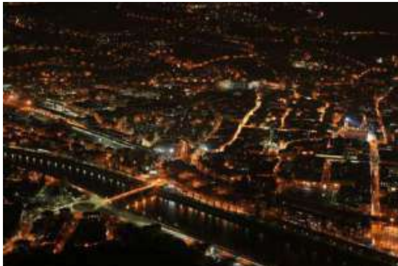
View from the hotel where the winter school took place