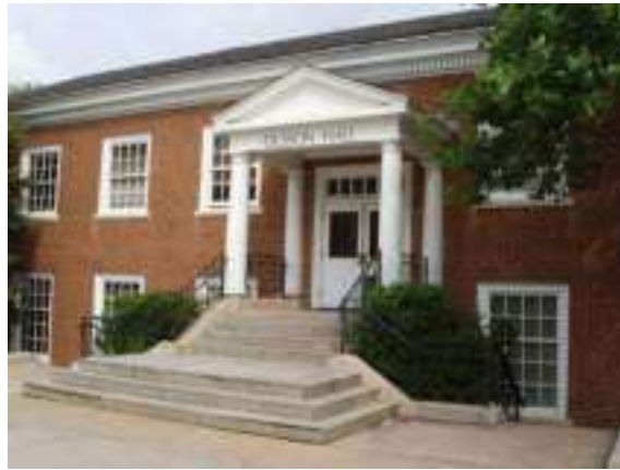
The building where I worked.

The opportunity to see another research environment I value highly. To be able to spend four months in rather large research group (approximately 20 PhD, 2 Post Doc and 2 Professors) has made an impression on me and I am confident that my continued PhD studies will benefit from this experience. In the specific project that I carried out during my time at the University of Virginia I was able to collect sensor reading that I later on can use as input to one of my simulations. Something that I hope will be a substantial part of my thesis. The possibility to work with sensors and the programming of sensors I find invaluable and I also see the potential for future projects, some of which I am already working towards.