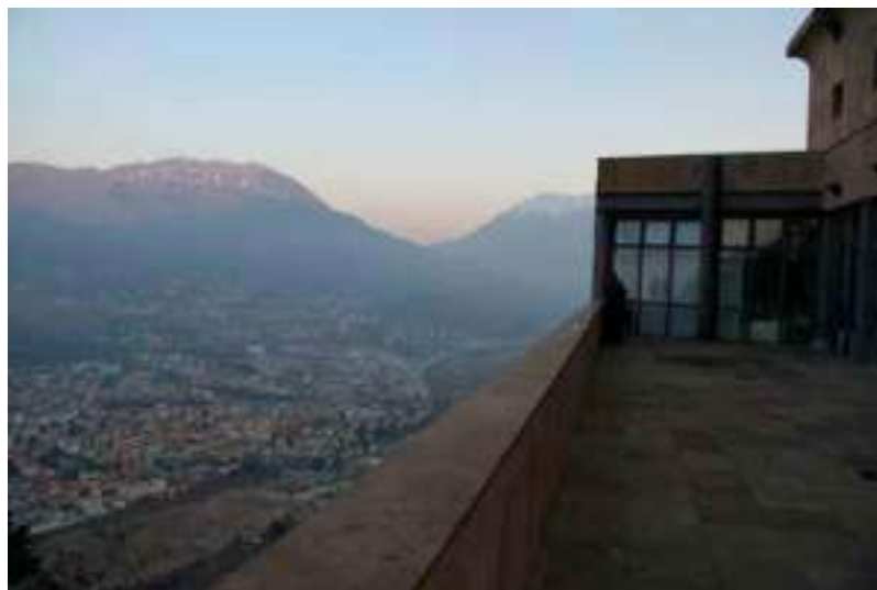
The view from the conference center terrace.

The venue of the school was very spectacular; the conference center is located on the top of the mountain right above Trento downtown. I have met many PhD students and we have had fruitful discussions during the breaks, over lunch and at the social dinner.