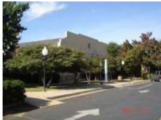
Fig. 2 My working place