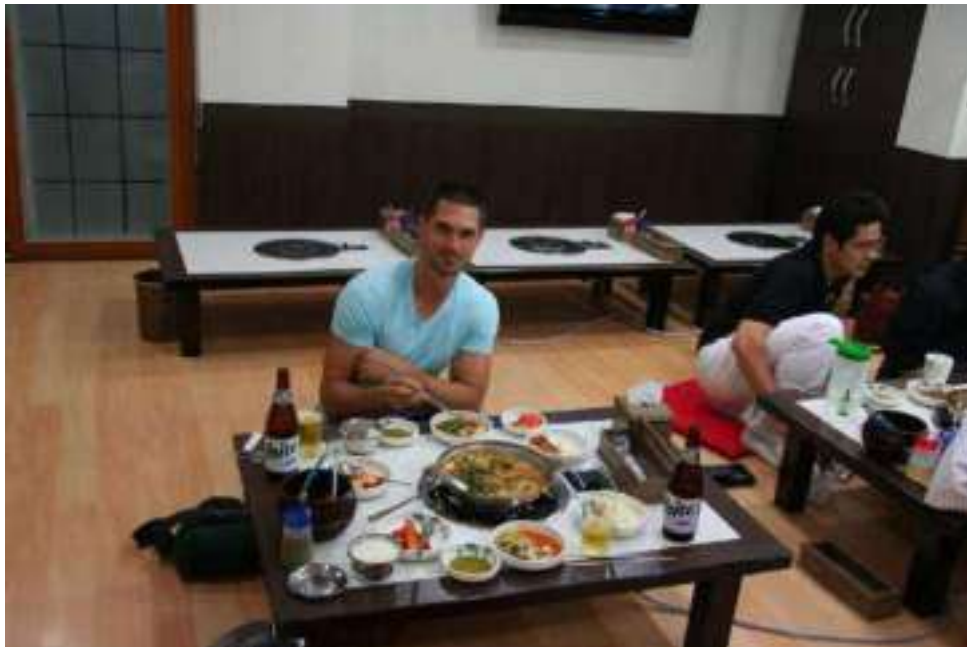
Figure 1. Korean traditional style fish restaurant.

The overall stay in Korea was very nice and very different from what I am used to. The people, the culture, the food and the cities is everything but European; but in a nice way. People are very friendly and constantly try to help. The food is quite spicy and it is common to share the food among several people, meaning that several people are eating from the same plate - also quite uncommon in Europe. All these things together with a well organized and interesting conference made our stay very exciting.