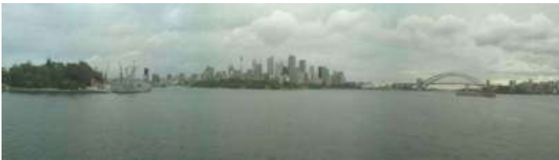
Conference dinner view: Sydney CBD including the famous opera house

In summary, the conference was very good. I learned a lot but, perhaps most importantly, I met and discussed research ideas with some of the leading researchers in the area.