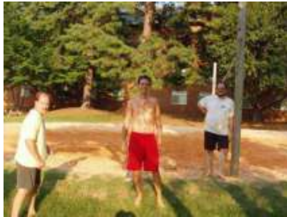
Beach volleyball with some friends from UVA.