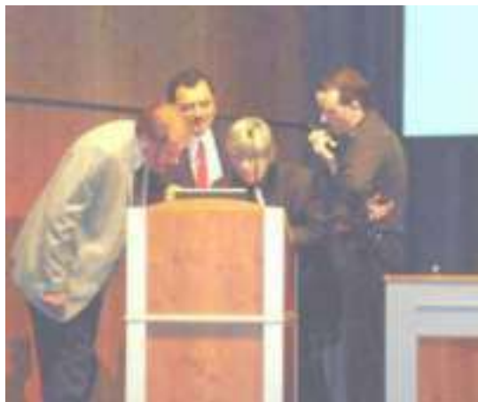
Solving problems with the presentation

DSN (Dependable Systems and Networks) is the annual international conference that directly addresses the requirement of dependability; presenting research and solutions, and posing new challenges. In 2007 the DSN conference will once again incorporate the Dependable Computing and Communications Symposium (DCCS) and the Performance and Dependability Symposium (PDS), together with workshops, tutorials, student forum, fast abstracts and an exhibition of tools and technologies. This years DSN contained 80 papers and corresponding presentations in the DCCS and PDS tracks and also papers and presentations in the student forum, fast abstract and several workshops taking place.