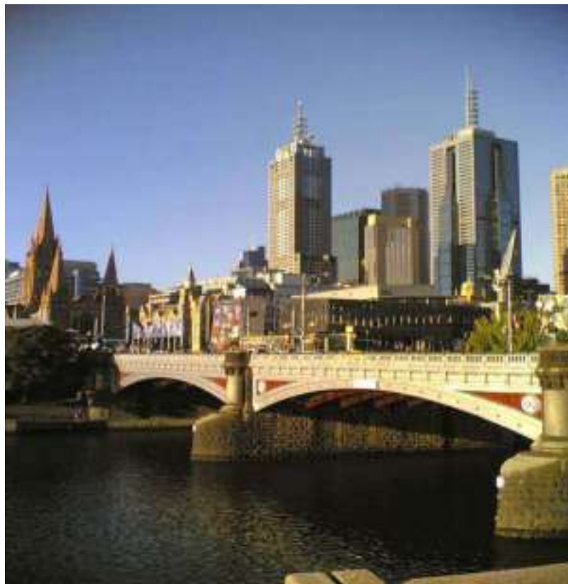
Melbourne Central Business District, close to the Yarra River

The symposium is returning to Melbourne in 2007 and will be held in one of the centrally located inner city hotels. Melbourne is a vibrant cosmopolitan city that has frequently been awarded one of the world's most "liveable" cities. Melbourne offers an excellent location for this Symposium with numerous local arts, cultural, architectural and sporting attractions. It also provides an excellent hub for many of the tourist attractions throughout Victoria and Australia.