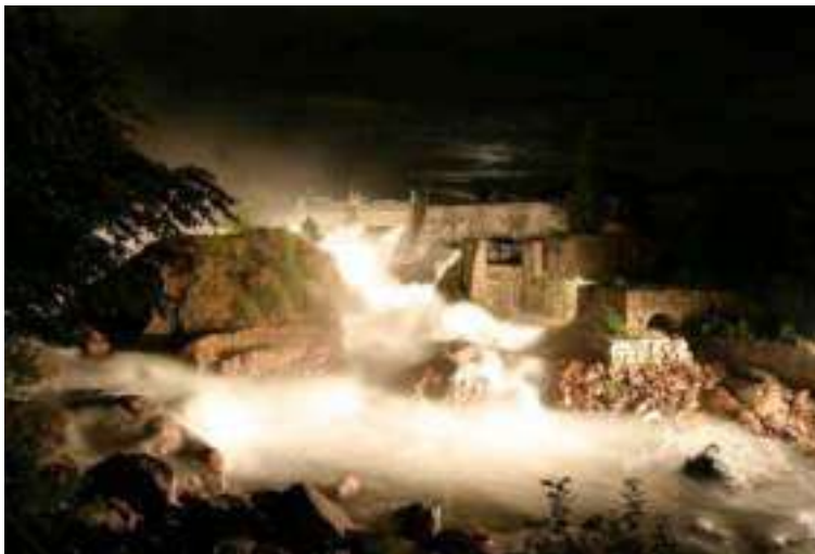
Fabulous Trollhättan Water Falls by Night

ISSRE focuses on the theory and practice of Software Reliability Engineering. The conference scope includes techniques and practices to (1) verify and validate software, (2) estimate and predict its dependability, and (3) make it more tolerant/robust to faults. The conference has grown steadily, attracting about 200 participants on a regular basis and is big enough to represent major topics in software reliability engineering, but small enough to provide an in-depth representation of theory or practice in these areas. Industry participation has also increased over time, leading to a healthy mixture of theory and practice.