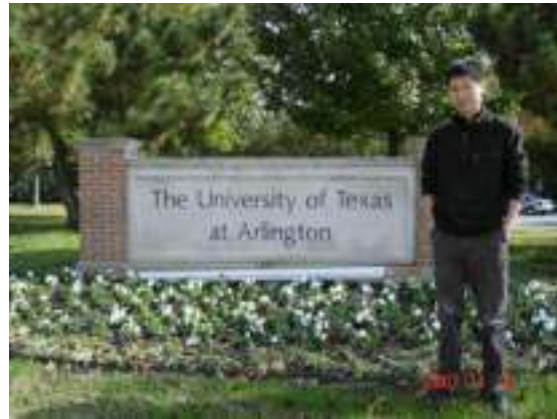
Fig. 1 Visting UTA

Generally, it was a wonderful experience. Thanks ARTES for its generous support. Finally, I would like to share some pictures taken at USA.